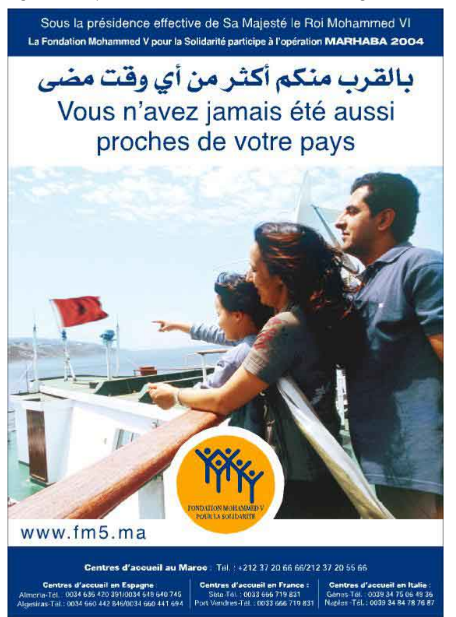
Figure 2. "Opération Marhaba" advert welcoming homecoming migrants

However, apart from Opération Transit , on the governmental level no coherent policies towards migrants had been developed around the turn of the century. The main character of the new policies towards emigrants remained symbolical and expressed at the level of official (royal) discourses. The practical neglect of the issue by mainstream political parties was presumably linked to the fact the emigrants do not vote or stand for election (Belguendouz 2006: 13). In 2002, finally, a Minister for Moroccans abroad was re-created, although still as part of the Ministry of Foreign Affairs and lacking an own budget or personnel. This led