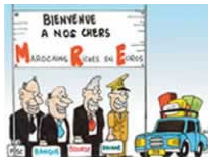
Source: <u>http://www.bladi.net/12127-tourisme-mre-maroc.html</u> (retrieved 13 June 2007)

Figure 4. Cartoon on Moroccan website <u>www.bladi.net</u> (text on banner: "Welcome to our dear ones: Moroccans Rich in Euros")