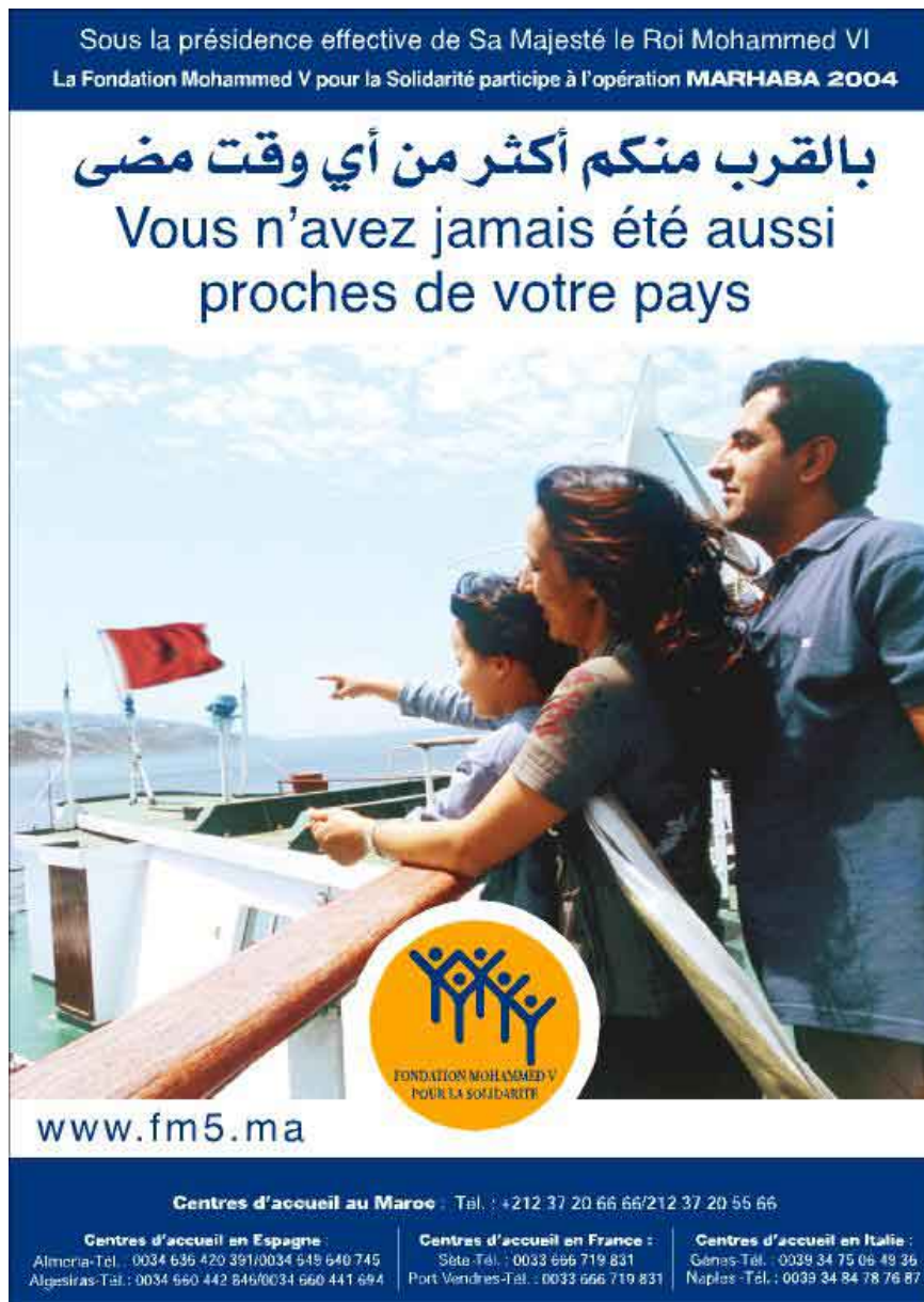
Figure 2. "Opération Marhaba" advert welcoming homecoming migrants

However, apart from Opération Transit , on the governmental level no coherent policies towards migrants had been developed around the turn of the century. The main character of the new policies towards emigrants remained symbolical and expressed at the level of official (royal) discourses. The practical neglect of the issue by mainstream political parties was presumably linked to the fact the emigrants do not vote or stand for election (Belguendouz 2006: 13). In 2002, finally, a Minister for Moroccans abroad was re-created, although still as part of the Ministry of Foreign Affairs and lacking an own budget or personnel. This led