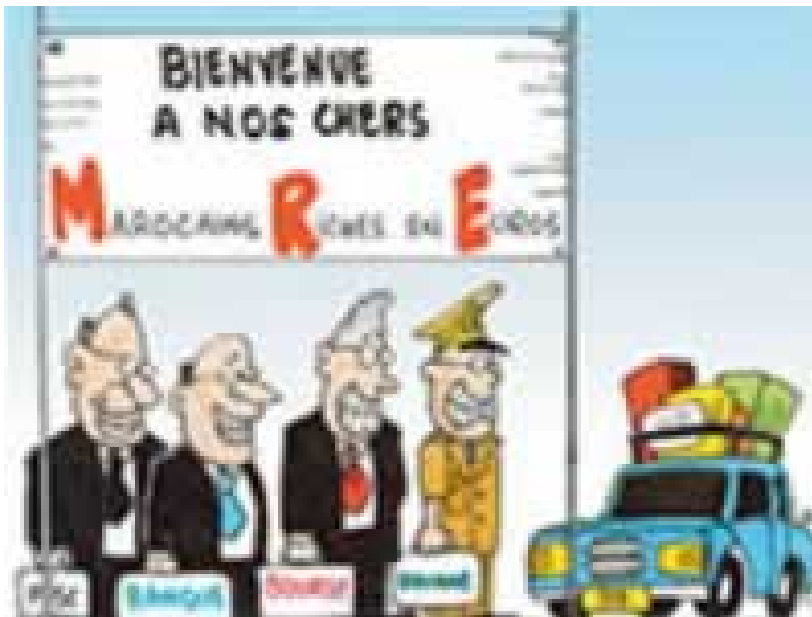
Figure 4. Cartoon on Moroccan website www.bladi.net (text on banner: "Welcome to our dear ones: Moroccans Rich in Euros")